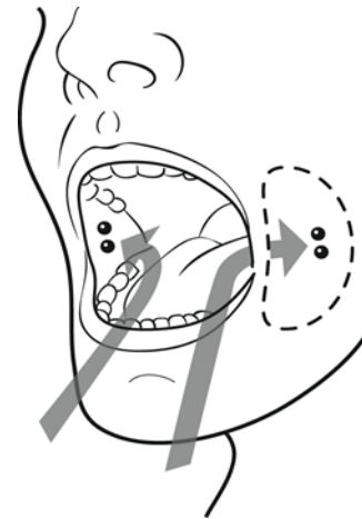
Figure A (2 tablets between your left cheek and gum and 2 tablets between your right cheek and gum).